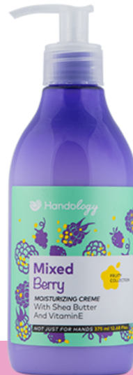
MIXED BERRIES WITH THE SWEET AND FRUITY SCENT OF BERRIES