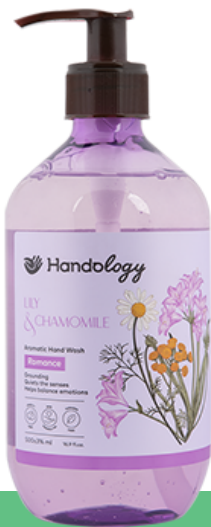
SCENT OF LILY AND CHAMOMILE