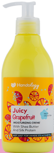
JUICY GRAPEFRUIT WITH THE FRUITY AND COOL SCENT OF GRAPEFRUIT