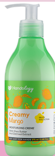
CREAMY MANGO WITH THE WARM AND ENERGIZING SCENT OF MANGO