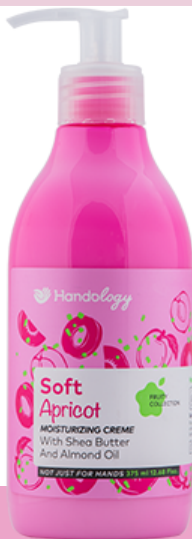
SOFT APRICOT WITH THE FRUITY AND SWEET SCENT OF APRICOT