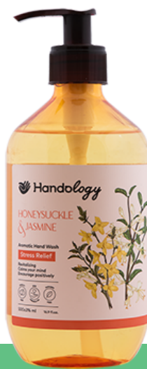
SCENT OF HONEYSUCKLE AND JASMINE