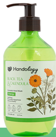
SCENT OF BLACK TEA AND CALENDULA