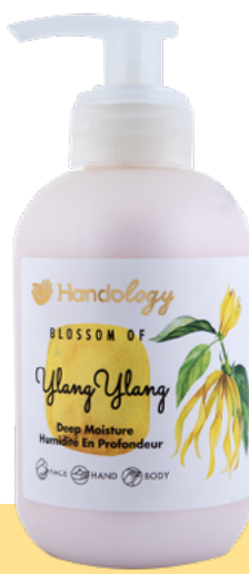
YLANG YLANG BLOSSOM

WITH THE FLORAL SCENT OF YLANG YLANG BLOSSOM